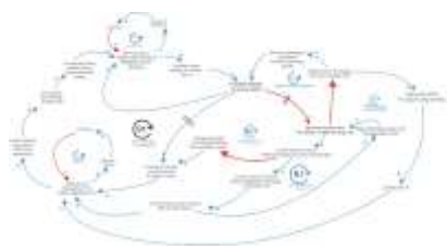
Figure 4. Results of the analysis of the information system implementation process

Supervision donors are also tasked with ensuring that the funds provided are used transparently and on target. They oversee the allocation of funds for various needs, such as system development, bug fixes, feature enhancements, or the procurement of supporting devices. This is important to maintain the efficiency and effectiveness of the budget used. The data from the above analysis then produces a process that is described in its entirety in the following design: