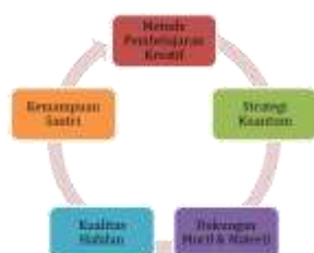
Figure 5. Thinking Patterns of Management Information Systems (SIM) in Supporting the Qur'an Tahfidzul Learning Program at the Muhammadiyah Abudzar Al-Ghifari Islamic Boarding School, Batanghari, East Lampung

the Muhammadiyah Abudzar Al-Ghifari Islamic Boarding School is influenced by creative learning methods by teachers, quantum strategies and moral and material support by donors so that it can improve students' memorization in terms of cognitive, affective and psychomotor. This mindset is described as follows: