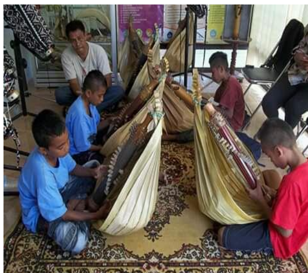
Figure 1. The teacher (trainer) is accompanying four junior students to practice fingering techniques, location of scales and violin sasando chords (Margareta, 2022)

The learning method at the Edon music studio uses several methods, namely lecture, demonstration and drill methods. There is a lecture method with the aim of conveying Sasando learning material as a whole to students. Regardless of that demonstration is an effective learning method, because students can know directly the application of a material in everyday life. According to (Majid, 2014, p.197) the demonstration method is the presentation of lessons by demonstrating and demonstrating to students about a certain process, situation or object, either real or just an imitation. Based on the existing concept, delivering material to students using learning media, namely Sasando Biola, aims to develop material descriptions orally and in practice, while the drill method emphasizes training activities that are carried out continuously 1-3 times, on fingering technique exercises, tone placement, and chord accuracy with the wrong song melody. Doing the exercises repeatedly and continuously because the background of students in terms of levels of creativity, intelligence, and psychological factors is different.